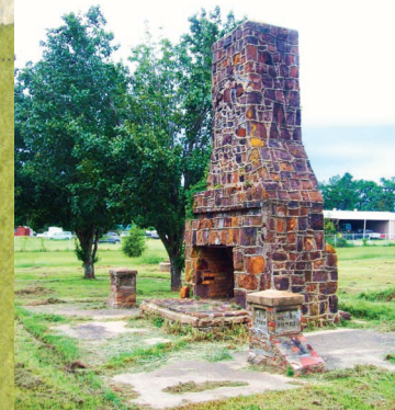
Chimney standing in Sue Stabler Park

The walk is an easy one, with the unique feel of a western Alabama small town, and is suitable for walking or cycling.