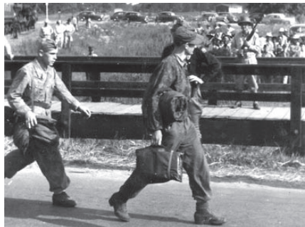
Aliceville residents watch as WW II German prisoners arrive.

The Aliceville Alabama Passport to Fitness walk begins in the heart of town at 104 Broad Street, the location of the Aliceville Museum and Cultural Arts Center. The museum sees over 3,000 visitors each year from around the world.